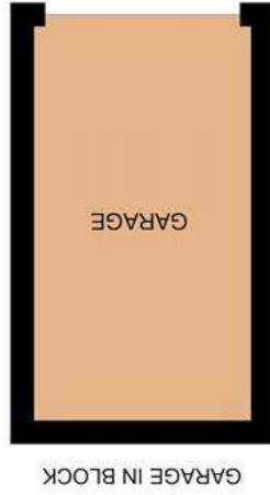
GARAGE IN BLOCK

TOTAL APPROX. FLOOR AREA 49.0 SQ.M / 527 SQ.FT. (EX. GARAGE) All measurements of doors, windows, rooms and any other items are approximate and no responsibility is taken for any error, omission or mis-statement. This plan is for illustrative purposes only and should be used as such. Not to scale. Huntandnash.co.uk